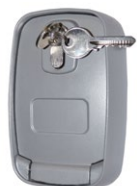
Safe box S004