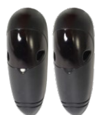
Photocells set RF37