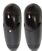
Photocells set RF37