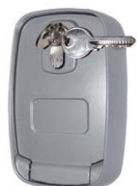
Safe box S004